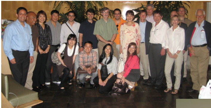
Above: Agents & Distributors, EPI Management & Staff