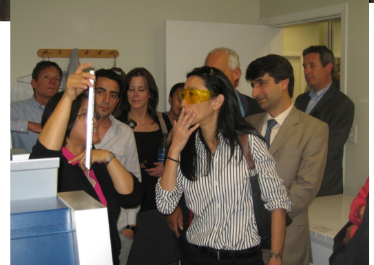
Above: Agents and Distributors Visiting EPI's Lab

EPI Environmental Technologies Inc. Suite 801, 1788 West Broadway Vancouver, BC V6J 1Y1 Canada Phone: +1.604.738.6281 Fax: +1.604.738.7839 E-mail: info@epi-global.com Web Site: www.epi-global.com